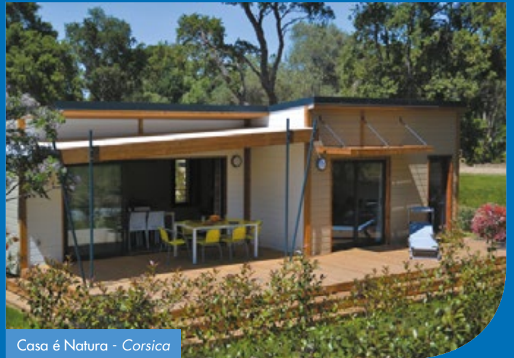
Casa é Natura - Corsica