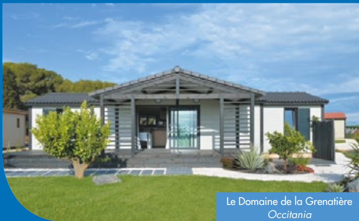
Le Domaine de la Grenatière Occitania