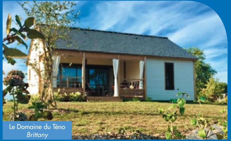
Le Domaine du Téo Brittany